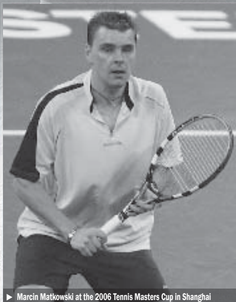
► Marcin Matkowski at the 2006 Tennis Masters Cup in Shanghai