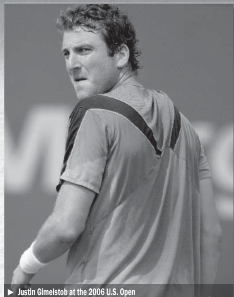
► Justin Gimelstob at the 2006 U.S. Open