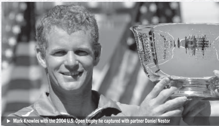
► Mark Knowles with the 2004 U.S. Open trophy he captured with partner Daniel Nestor