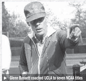
Glenn Bassett coached UCLA to seven NCAA titles