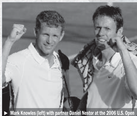
► Mark Knowles (left) with partner Daniel Nestor at the 2006 U.S. Open