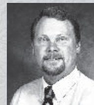
Paul Brown Event Management