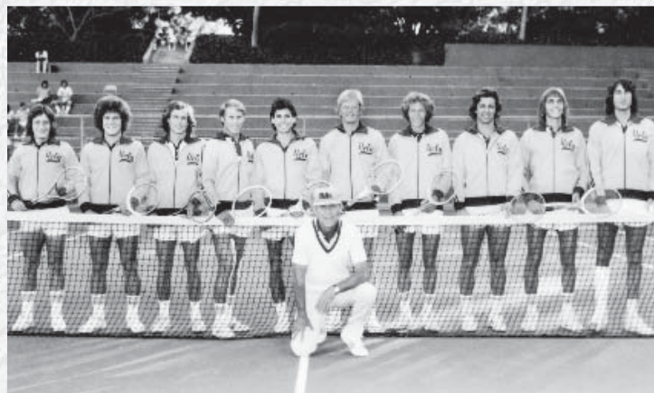
The 1975 Bruins captured the NCAA title and finished 19-0. They are the last team to end a season undefeated.