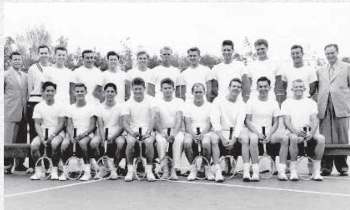
The 1950 Bruin men's tennis team captured UCLA's first-ever NCAA Championship in any sport.