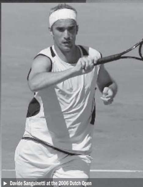
► Davide Sanguinetti at the 2006 Dutch Open