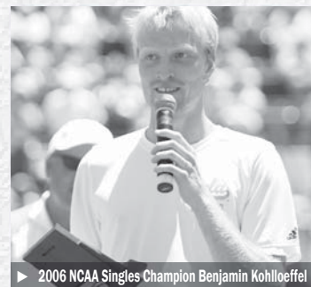
2006 NCAA Singles Champion Benjamin Kohlhoeffel